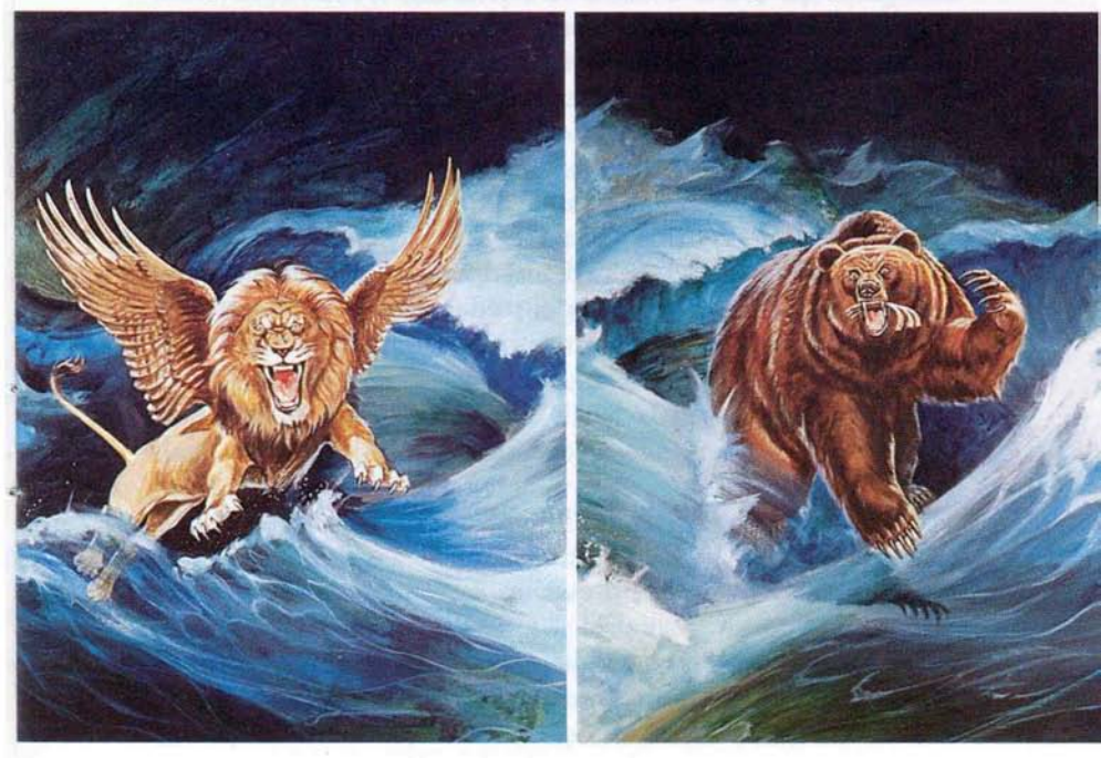
THE ILLUSTRATIONS depict the first two of four beasts that emerged from a turbulent sea in Daniel's dream (Dan. 7).

Furthermore, these words are in the Latin, not a Bible language. This is not a name, but a title, and it is the name of the beast, and the number of the name of the man of the beast we are told to count. Further, this Latin title does not apply to a kingdom, or empire, but alone to a man.