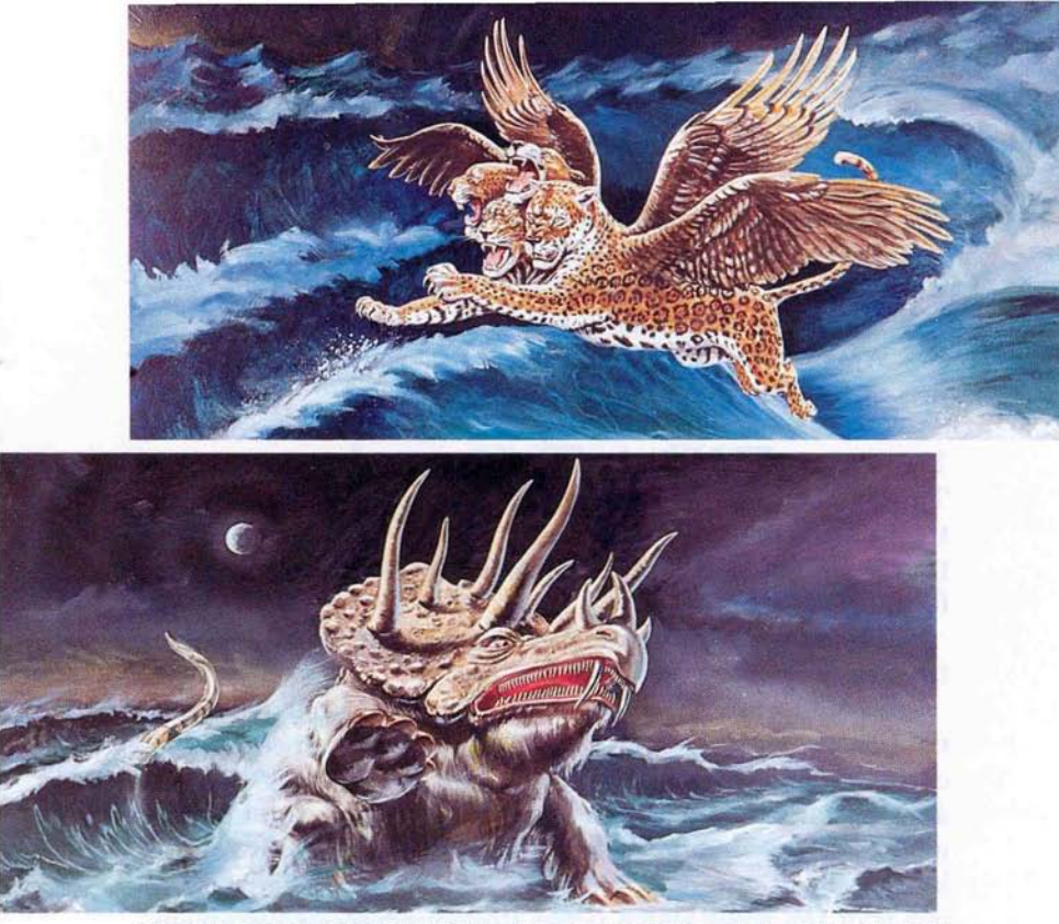
THE THIRD BEAST in Daniel's dream was followed by a fourth that was "dreadful and terrible" (Dan. 7).

civil government martyred millions who were declared "anathema from Christ" or "heretics."